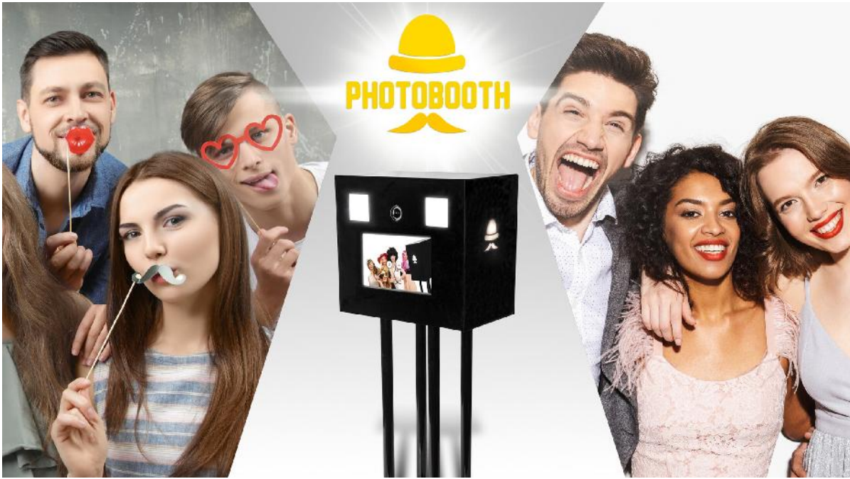
THE WOOD BOX